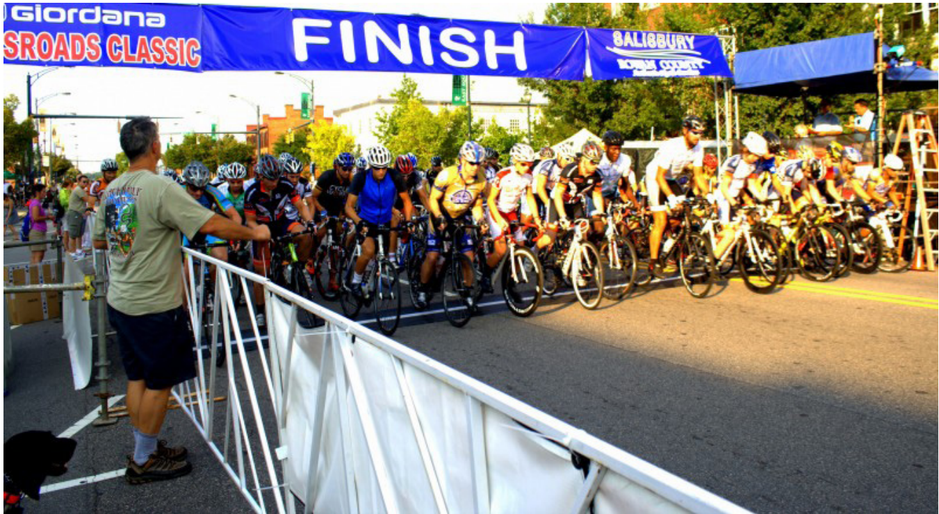
Salisbury Bike Race

The Cabarrus-Rowan MPO has an active membership and transportation planning process from project planning to programming to implementation to preservation. MPO members have taken ownership in the development of the transportation system. The 2055 MTP serves as the pathway for developing and managing this transportation system over the next 25 years.